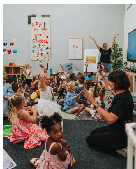
KIDS MINISTRY IN NATIONS CHURCH WANGARA

Looking ahead, we are planning to redevelop an upstairs room into a dedicated prayer and meeting space, rebuild the production booth, and progressively remove the go-kart track and internal play equipment. This will allow us to create a more open, flexible, and practical Next Gen space that better serves families.