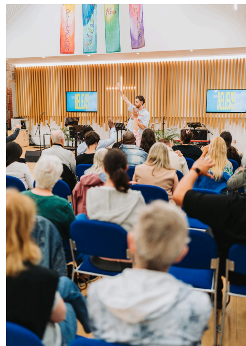
FIRST NATIONS CONFERENCE IN CORK, IRELAND