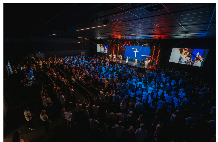
MAIN AUDITORIUM AT CAPACITY FOR EASTER SUNDAY