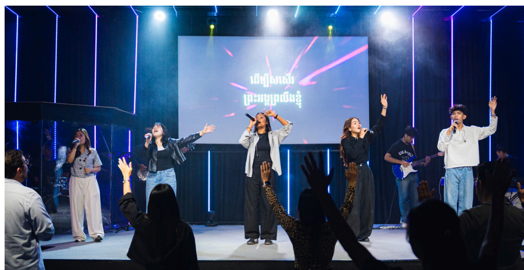
SERVICES IN PHNOM PENH, CAMBODIA

In 2018, we secured a 10-year land lease and built what is now our Nations Phnom Penh campus. While we own the building, we do not own the land, putting us in a season of prayer and discernment around the future. We are beginning to explore conversations and negotiations with the landlord, believing for long-term security for the campus. Building Our Future enables us to take steps towards that outcome, so that what has been built can continue to serve generations to come. We are believing for a permanent, secure foundation for all that God wants to do in Phnom Penh.