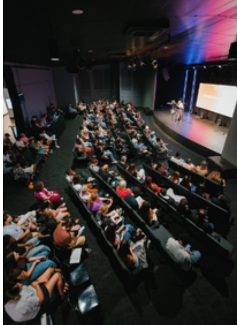
NATIONS CHURCH BELMONT AUDITORIUM AT CAPACITY

Belmont is a growing campus, with increasing momentum and a clear need for a larger, long-term home. Each week, services are filled with people hungry for Jesus, and momentum continues to build across the campus community.