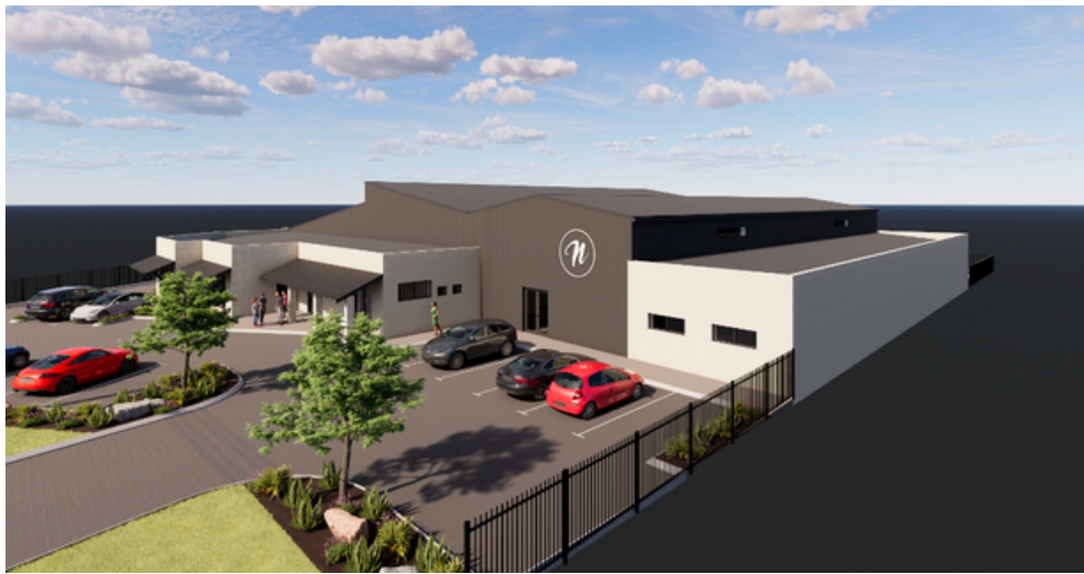
NATIONS CHURCH BUNBURY MOCK UP DESIGNS

A major breakthrough has been approval from Water Corporation to reroute the sewer line through the rear block. With the neighbouring property owner open to an easement or potential sale, this reduces the sewer run from 250 metres to 55 metres, saving more than $150k.