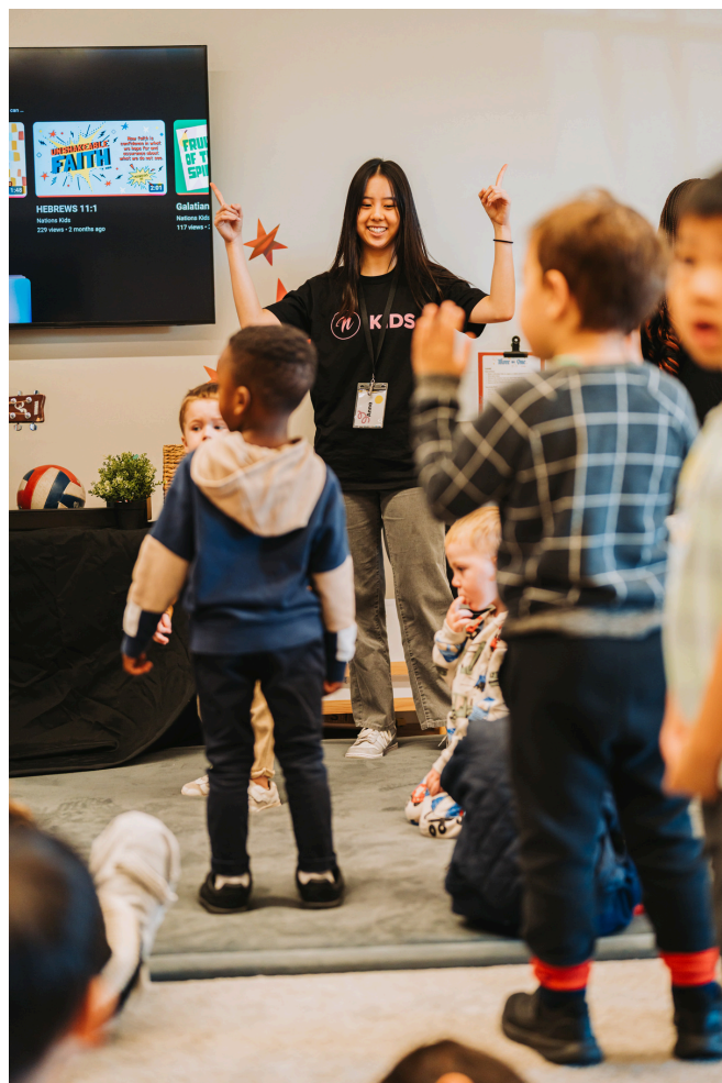
KIDS MINISTRY IN NATIONS CHURCH MYAREE

We have also installed approximately 300sqm of new carpet across the Next Gen foyer and Heroes areas. For 2026, around $50k has been set aside for further improvements. Recent updates include a refreshed tea and coffee station, new Welcome Lounge tables, and artificial grass in the Lower Primary and Heroes outdoor areas, giving kids more space to play and families more room to gather. Upcoming projects include retractable awnings and area dividers in the kids' areas, along with planning for a dedicated drinking and water bottle filling station in the main foyer.